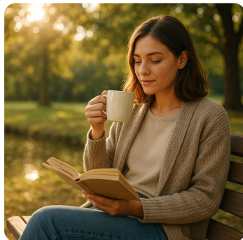
Time Alone sitting in solitude