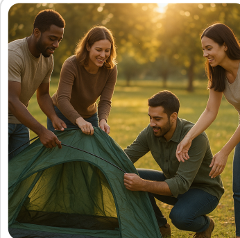
Help from Friends friends helping each other