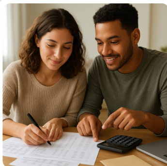
Money Management Help Managing finances together