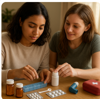
Medication/Health Support Holding medicine bottle