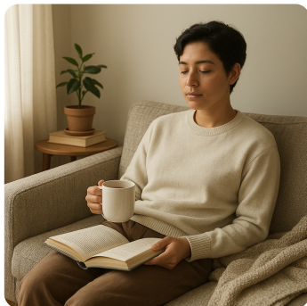
Quiet Space to Relax resting in silence