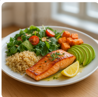
Healthy Food preparing fresh vegetables