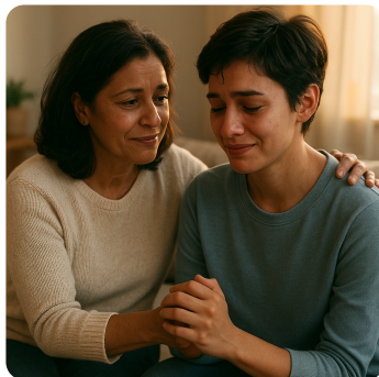
Help from Family Family members assisting others