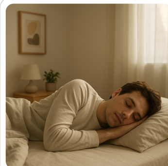
Good Sleep person sleeping soundly