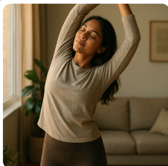
Exercise/Movement person running outdoors