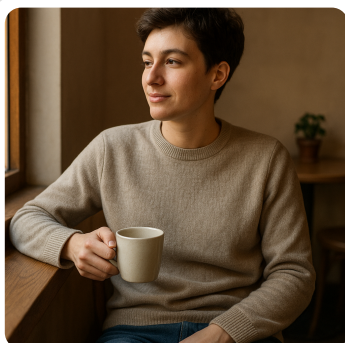
Breaks During the Day Taking a break