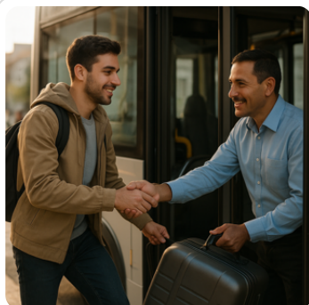
Transportation Help assisting a traveler